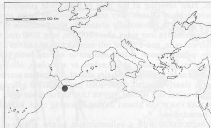
Map 55. Distribution map of S. beniboufraiana .

DISTRIBUTION: Endemic to the Rif (Secteur Beni-Bou-Frah) (Province Atlásico-Rifeña) (Map 55).